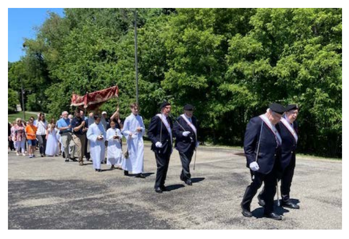
Our Color Corps During Corpus Christi Procession St. John Neumann